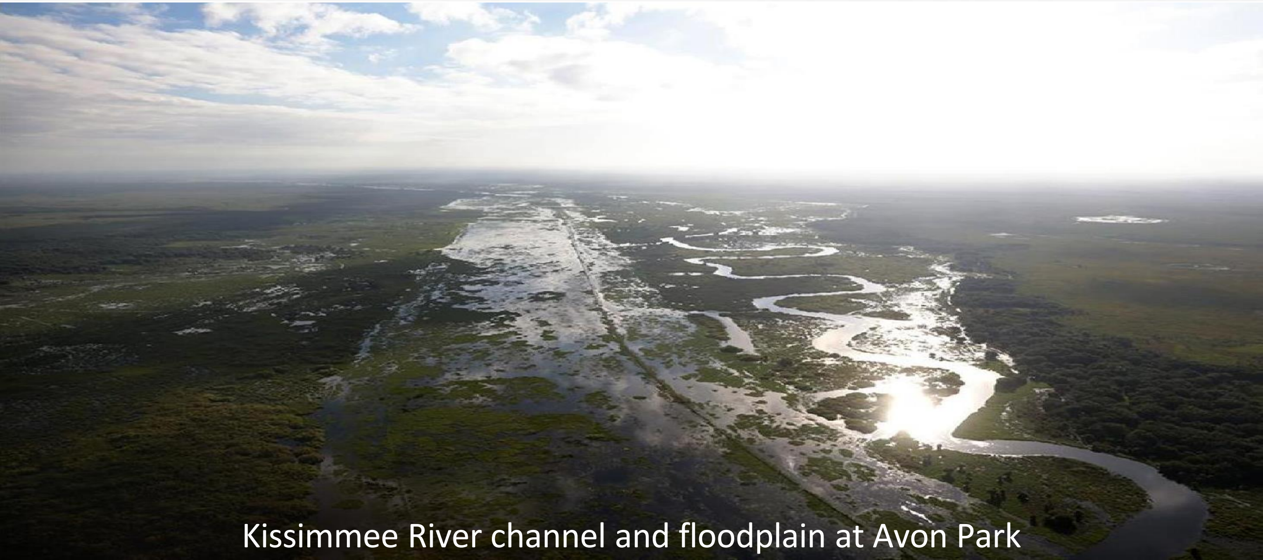
Kissimmee River channel and floodplain at Avon Park