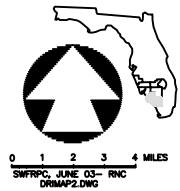
DRI MAP 2 WESTERN COLLIER COUNTY